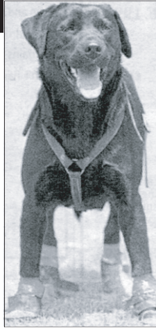
SMART: Fire dog Star