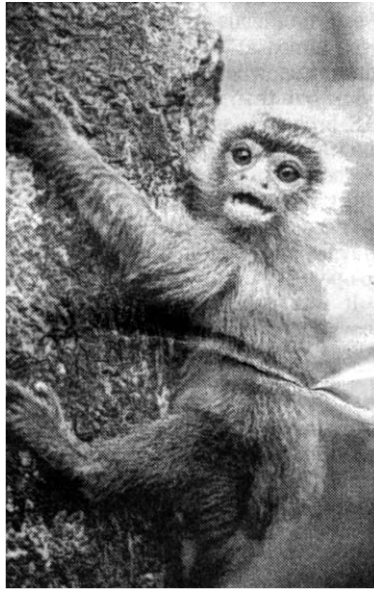
The black-headed sagui dwarf monkey is one of seven new primate species discovered in as many years.

It took him more than a year of hiking around the jungle until he located them near the Rio Aripuana.