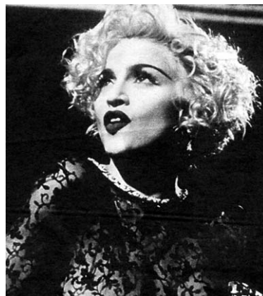
CAUSING A COMMOTION: The Material Girl